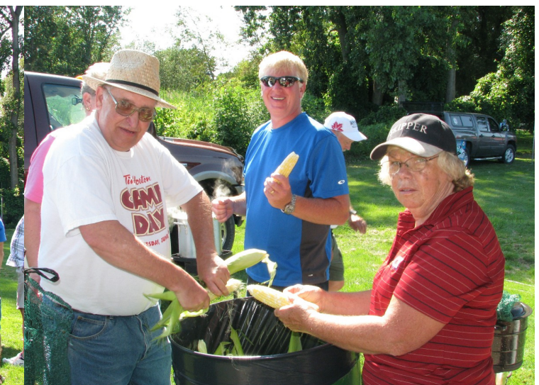
Shucking corn for the hungry masses