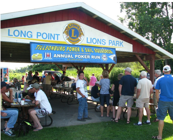
All lined up to turn in the cards and hope for a winning hand